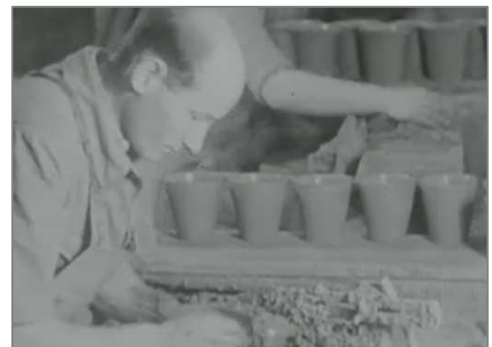
Right – Slip-casting Flowerpots. Far right – Potter throwing Flowerpots, both at Upshire. (1954 EAFA Still)

Land rains will be familiar to all those who have dug at Copped Hall. During the 19 th C new mechanical ways of producing bricks were developed. However the combined problems of flawed design and excise duties (in place between 1784 & 1850) restricted their adoption, as designs were crude and unreliable, but the tax had to be paid on all bricks even those damaged and unusable. This led to a reluctance to invest in new machinery. Without the opportunity to test the new machinery in mass brickmaking situations, manufacturers were unable to refine the machines and demonstrate their efficiency.